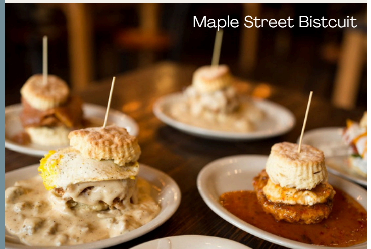
Maple Street Bistcuit